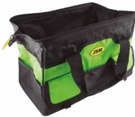
REAR AND SIDE POCKETS