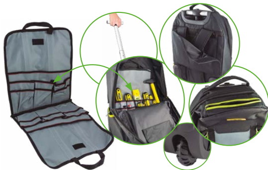
WITH INNER ENVELOPE